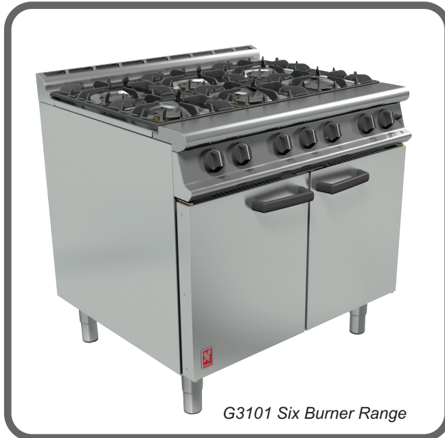
G3101 Six Burner Range