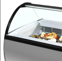
Curved glass for nice presentation