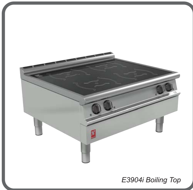
E3904i Boiling Top