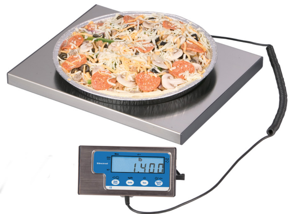
WS15 for use in portion control applications