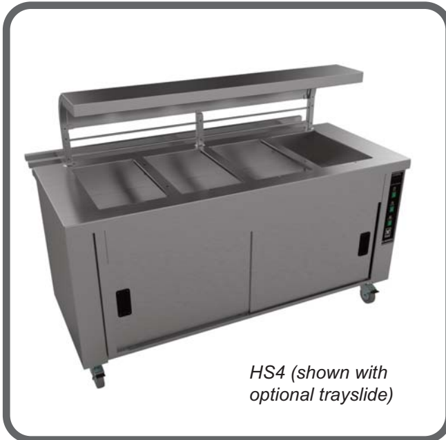
HS4 (shown with optional trayslide)