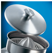
Lid - optional