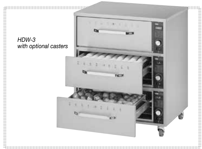
HDW-3 with optional casters