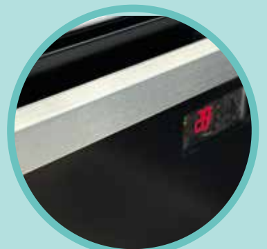
Stainless Steel Bumper Bar