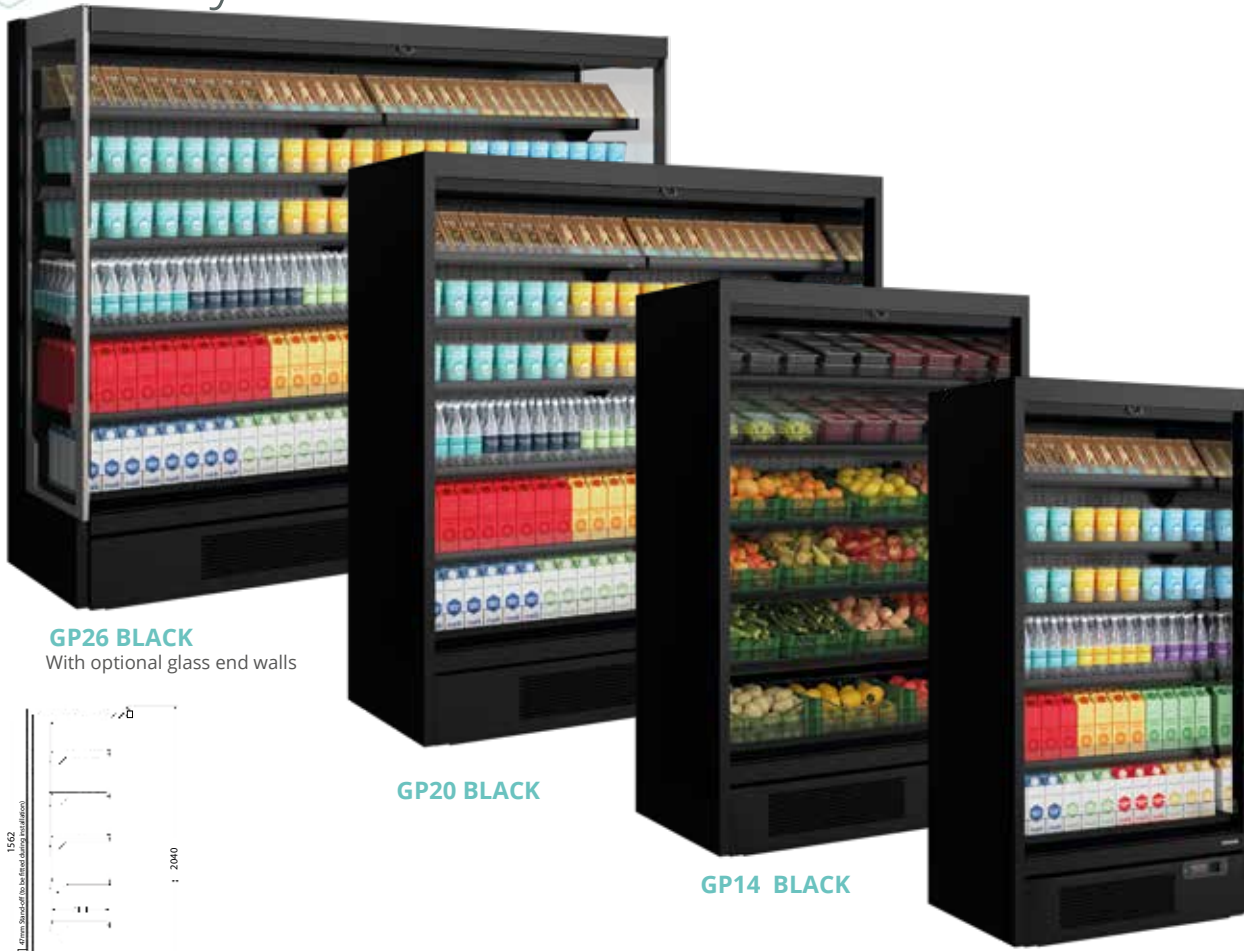
GP26 BLACK With optional glass end walls