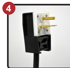
Two Ovens, Only One Plug