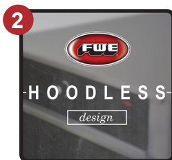
Designed To Not Require A Hood