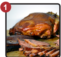
Reduce Shrinkage, Natural Browning