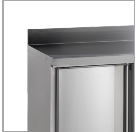
Available with splash back