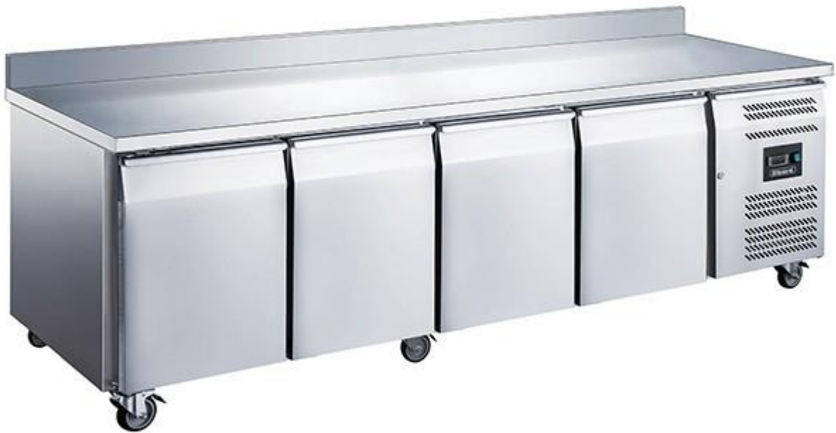
Image shown is the HBC4XX With Upstand