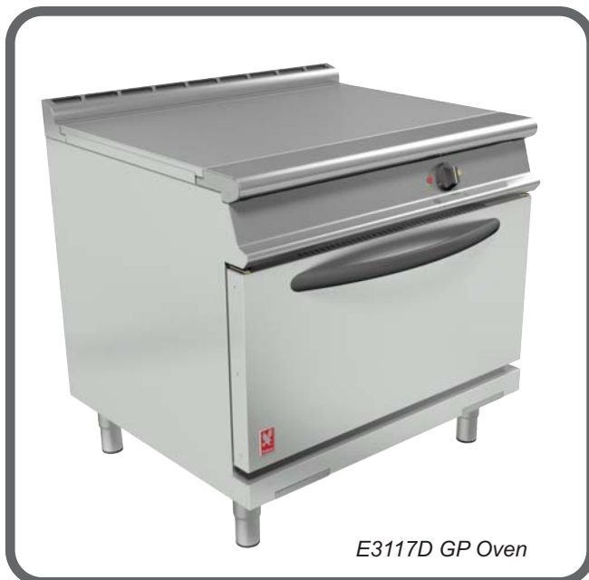
E3117D GP Oven