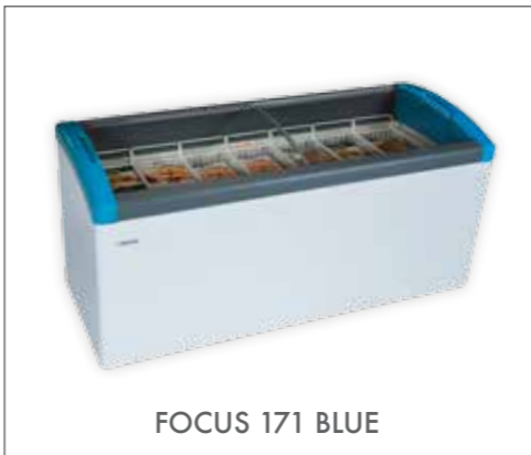
FOCUS 171 BLUE