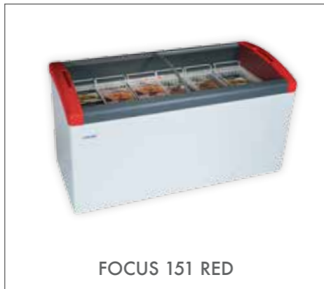
FOCUS 151 RED