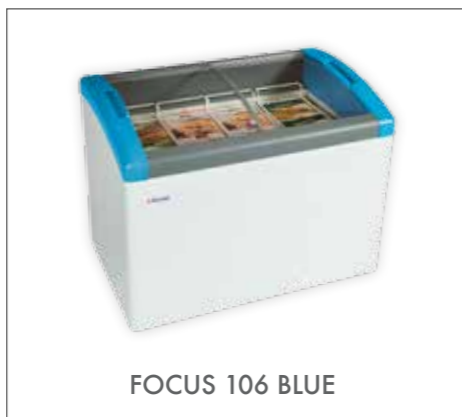
FOCUS 106 BLUE