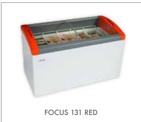
FOCUS 131 RED