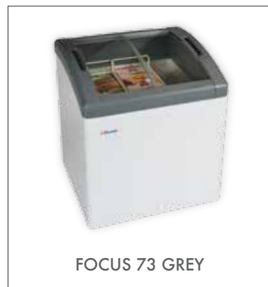
FOCUS 73 GREY

Cyclopentane is used as blowing agent and the cabinets are CFC free.