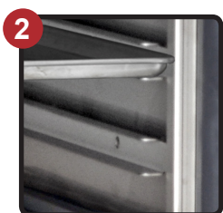
Unique Pan Slides