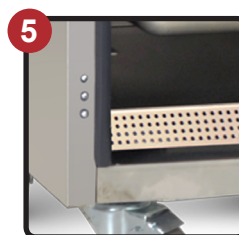
Field Reversible Door