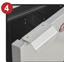
Magnetic Work Flow Handles