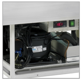
Automatic evaporation of defrost water