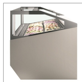
Glass end walls as standard