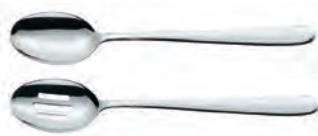
Chafing dish cutlery Cromargan® length 26 cm / 10¼ in. Spoon 12.8386.6041 Fork 12.8386.6042