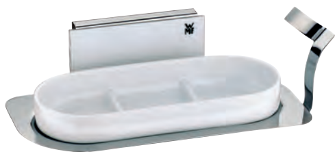
Tray/cutlery holder Cromargan® 06.3539.6040

With taste and style, the elegant porcelain and Cromargan® WMF utensil rack is the per- fect complement to the WMF HOT & FRESH chafing dish. Just slot it in, place the serving spoon on top and that's it!