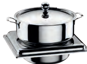
ltr. 9 / 315 oz. pot with normal lid ring 06.3297.6040 06.2094.6044