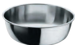
Insert Cromargan® round depth 80 mm / 3¼ in. 06.2083.6034