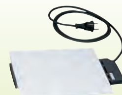
Heating element for stands GN 2/3 and round, 140-250 V / 220 W, 25 x 20 cm / 9¾ x 8 in. 55.0095.6044