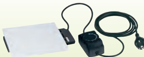
Heating element for stands GN 2/3 and round 230 V / 700 W heat adjustable 25 x 20 cm / 9¾ x 8 in. 06.3286.6046