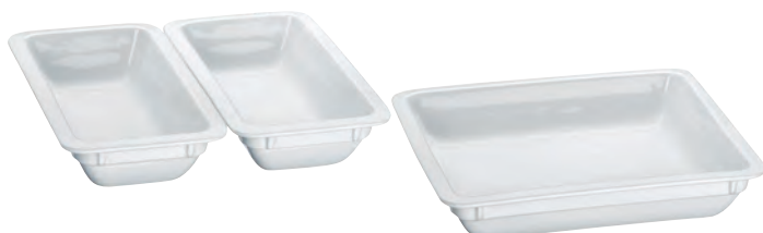
GN 1/3 depth 20 mm / ¾ in. 60.3055.9990 GN 1/3 depth 65 mm / 2½ in. 60.3047.9990 GN 2/3 depth 20 mm / ¾ in. 60.3056.9990 GN 2/3 depth 65 mm / 2½ in. 60.3046.9990