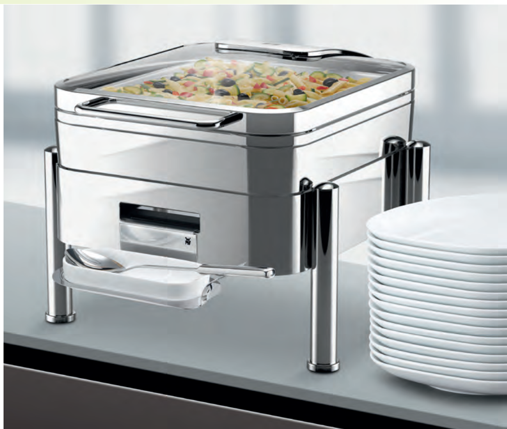
Porcelain bowl porcelain, white 60.3540.9990