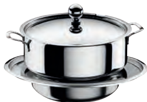
ltr. 9 / 315 oz. pot with normal lid ring 06.3297.6040 06.2087.6044