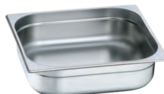
GN 2/3 depth 65 mm / 2½ in. 19.9955.0585 GN 2/3 depth 100 mm / 4 in. 19.9955.0586