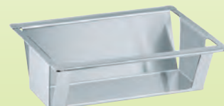
Burner holder for stands GN 2/3 and round, Cromargan® 26 x 20 x 8 cm / 10¼ x 8 x 3¼ in. 06.3322.6039