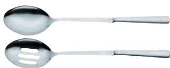
Chafing dish cutlery Cromargan® length 32 cm / 12½ in. Spoon 12.8381.6041 Fork 12.8381.6042