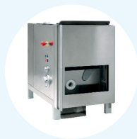
Cubo Dough Divider LLKDDCUBO