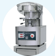
Heated Press LLKP30

Here are some other LLK products that may interest you. Search our website using the product code for more information.