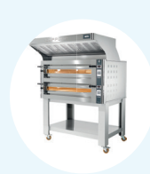
Donatello Oven LLKDN6352+