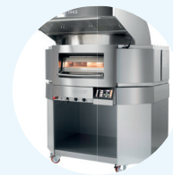
Giotto Oven LLKGIOTTOTS

Step away from hard labour and employ the Cuppone rounder today!