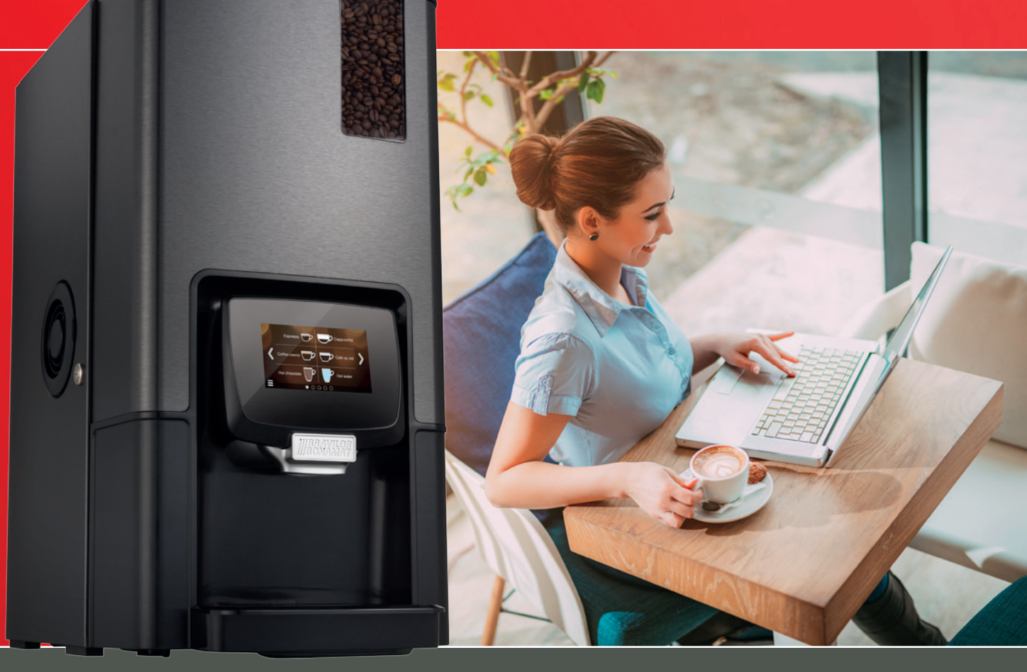
The taste of quality worldwide