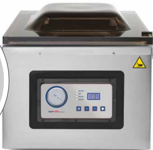
SVT-FRESCO400 PRODUCT SPECIFICATION