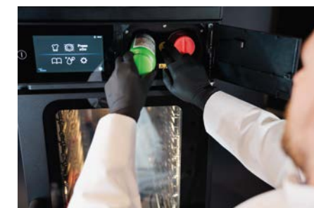
Solid-to-Liquid cleaning cartridges

The magic combination of convection heat and steam ensures food stays moist and fresh for longer. With Intelligent Steam Management, it optimizes moisture levels to create exceptional menus while reducing water and energy consumption, and food waste.