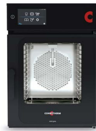
mini pro 6.06