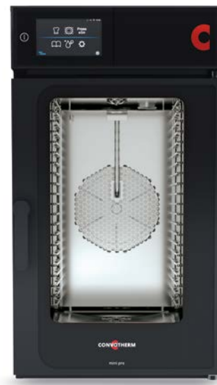
mini pro 10.10