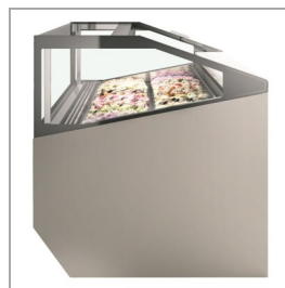
Glass end walls as standard