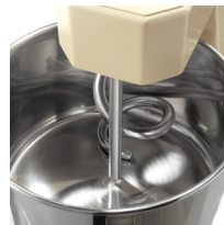
S/S bowl and shaft