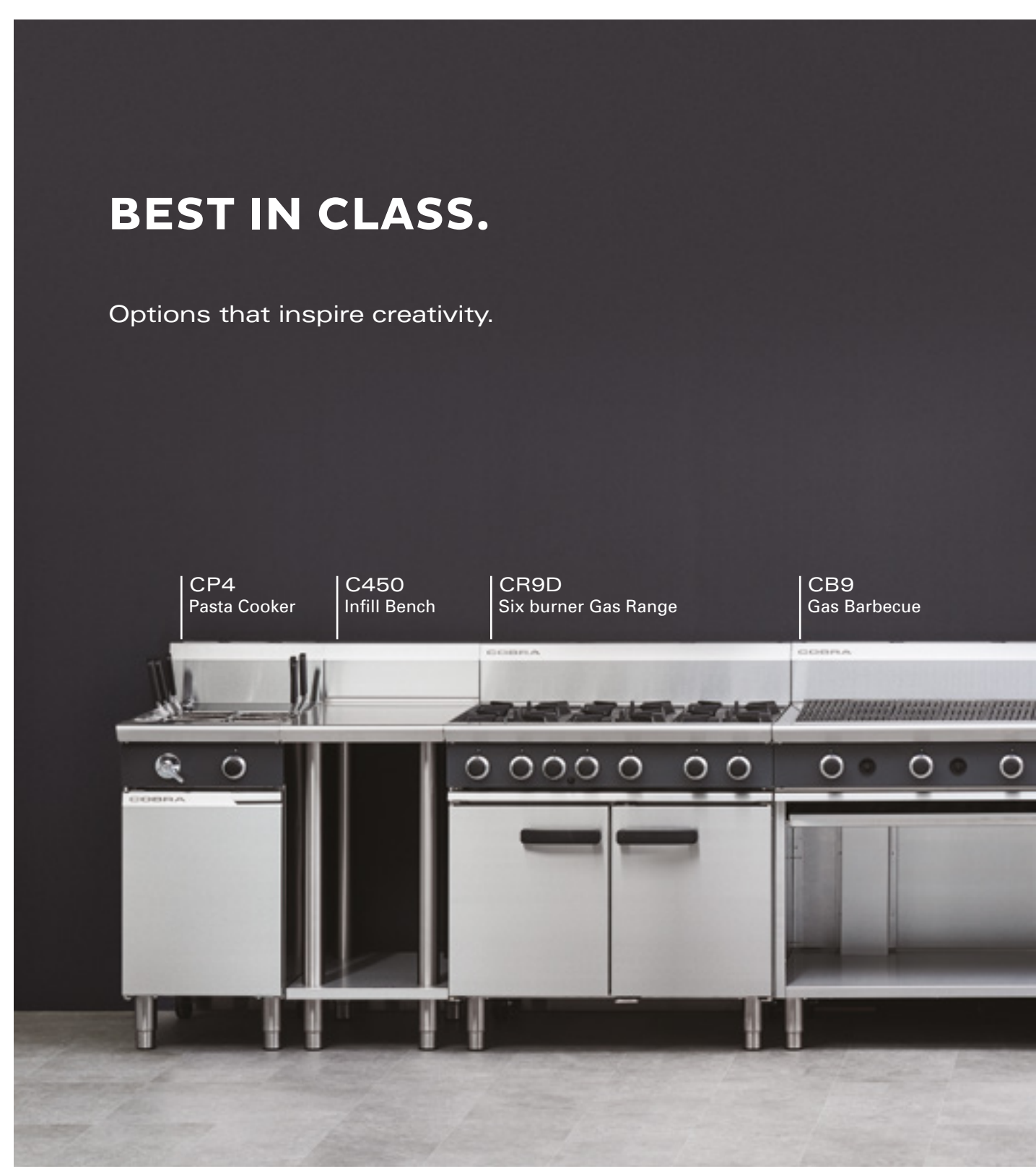
A SUGGESTED À LA CARTE RESTAURANT LINEUP