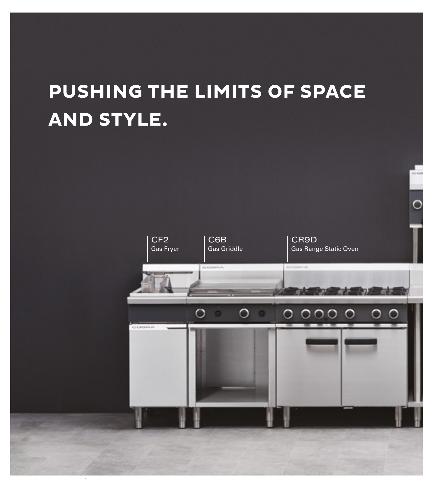
A SUGGESTED CAFÉ LINEUP