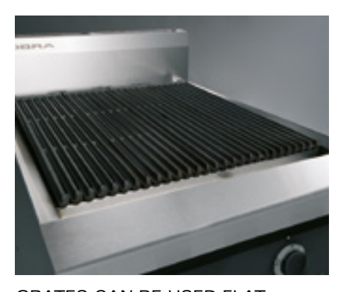
GRATES CAN BE USED FLAT OR TILTED.

Make a lasting impression with the cast iron grates with this heavy-duty barbecue. Used in either a flat or tilted position, they've got the ideal grate edge to produce a branded finish for visual appeal and taste.