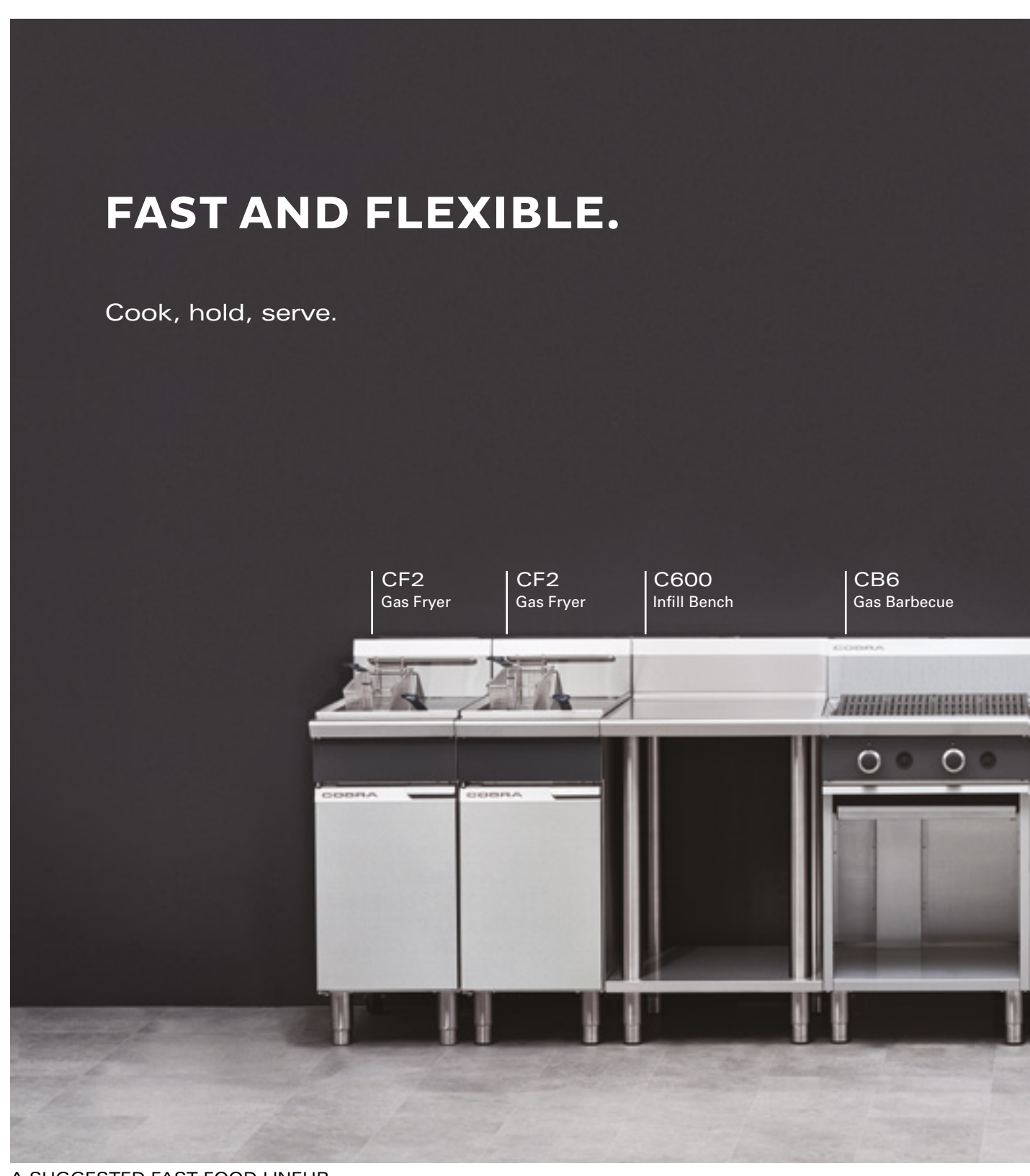
A SUGGESTED FAST FOOD LINEUP