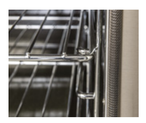
TOP: THE 900MM WIDE COBRA OVEN RANGE FEATURES A FULL WIDTH OVEN WITH GENEROUS CROWN HEIGHT AND SPACE SAVING FRENCH DOORS. ABOVE: NEW STAINLESS STEEL BRAIDED DOOR SEAL FOR BETTER HEAT RETENTION.

As the centrepiece of any kitchen the oven range needs to be a durable, dependable and adaptable workhorse. The Cobra oven range has a generous gastronorm capacity, with standard 2/1 GN or two 1/1 GN pans (900mm) and one 1/1 GN pan (600mm) on each rack. Side hinged door (600mm) and french doors (900mm) give full width access. The high crown height means this oven can consistently deliver any volume required.