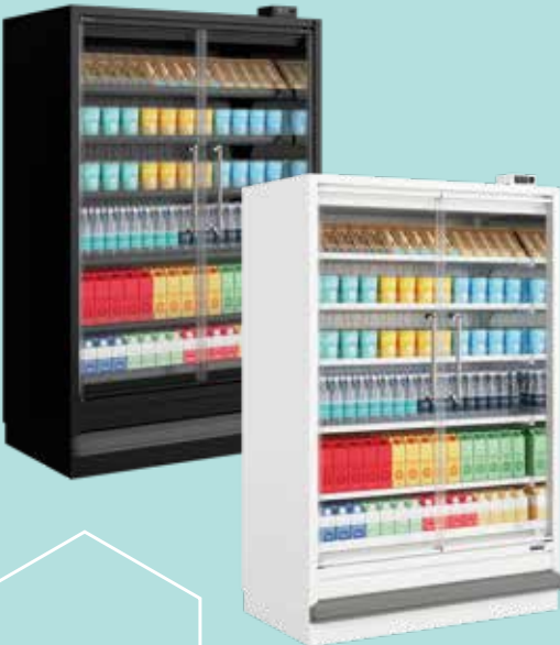
Other colour options available to order