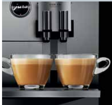
Variable dual spout with 2 coffee spouts and 2 milk spouts