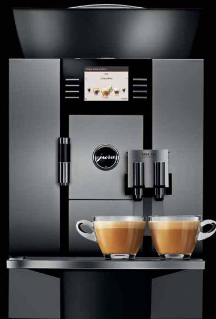
GIGA X3c Professional

With a wide selection of accessories including a cup warmer, milk cooler, coffee grounds disposal function set and interface for accounting systems, as well as an attractive range of storage and presentation units, it is possible to create a complete coffee solution tailored to your specific requirements.