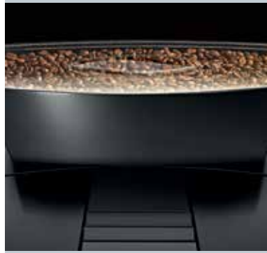
Professional ceramic disc grinder