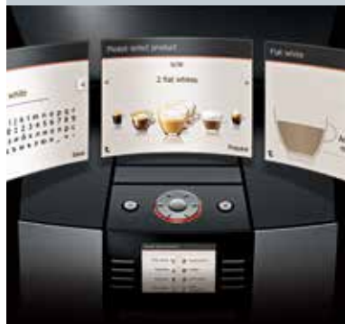
Customisable start screen