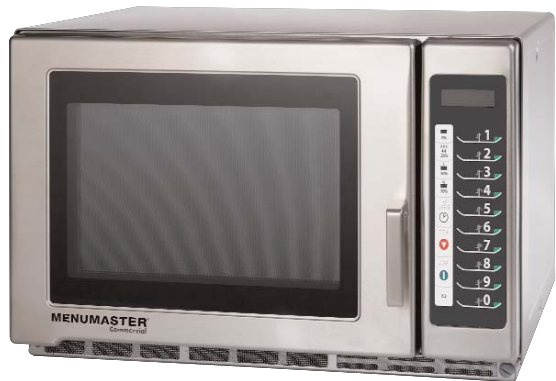
Model RFS518TS shown