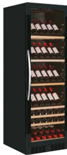
Above image shows optional display shelves