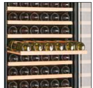
Slide out shelves for access