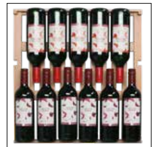
Layout of bottle on shelves