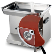
Optional Format M