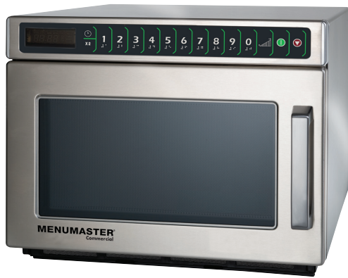
Model DEC21E2 shown