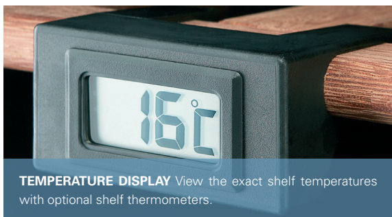
TEMPERATURE DISPLAY View the exact shelf temperatures with optional shelf thermometers.