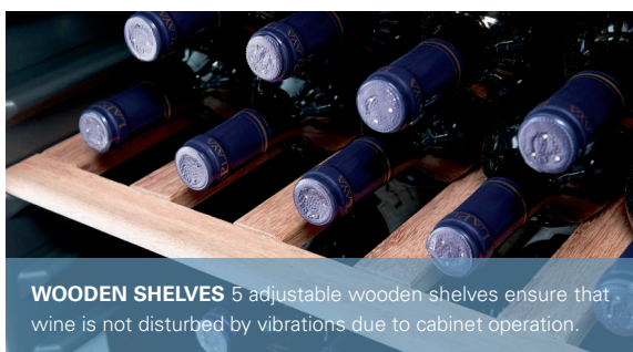
WOODEN SHELVES 5 adjustable wooden shelves ensure that wine is not disturbed by vibrations due to cabinet operation.