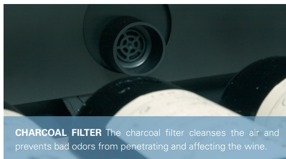
CHARCOAL FILTER The charcoal filter cleanses the air and prevents bad odors from penetrating and affecting the wine.