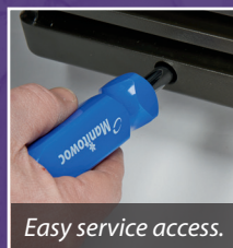
Easy service access.