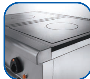
Twin heat zone