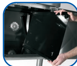
Removable oven liners