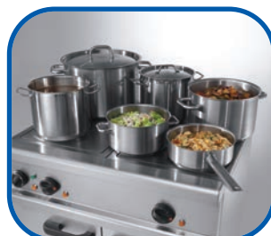
High capacity hob