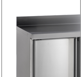
Available with splash back