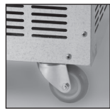
Pivoting rear wheels