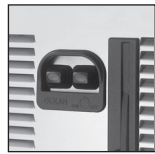
Front ON-OFF switch