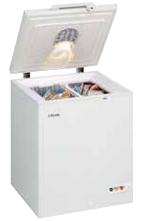
100 MM INSULATION