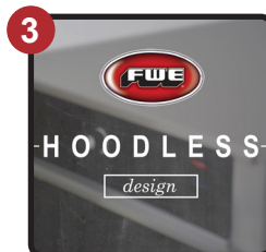
Designed To Not Require A Hood