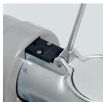
Microswitch on the lever