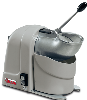
Sirman Ice Crusher , model Triton :

Authorized Distributor: FOODSERVICE EQUIPMENT MARKETING 10 CARRON PLACE-KELVIN IND.ESTATE G75 0YL GLASGOW() TEL./FAX. 0044-1355 244111 / 0044-1355 241471 E-mail:saganm@fem.co.uk