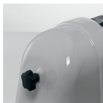
Cut thickness adjusting knob