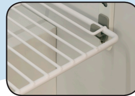
Fully adjustable non slip plastic coated shelves