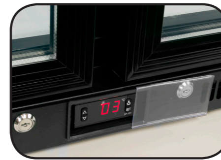
Covered and recessed digital temperature control