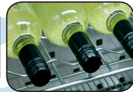
Optional wine shelf available on selected models