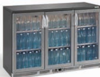
➤ MG2/315GCS | LG2/315GCS84 height 90 cm | height 84 cm

Fitted with 2 hinged glass doors with a stainless steel door frame and kick plate. Exterior made of anthracite steel panels