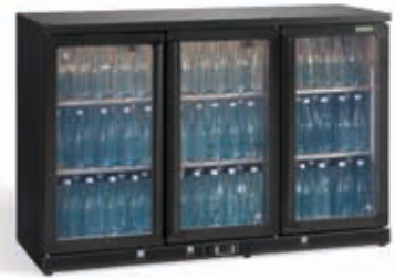
➤ MG2/315G | LG2/315G84 height 90 cm | height 84 cm

Fitted with 2 hinged glass doors with an anthracite door frame and exterior made of anthracite steel panels