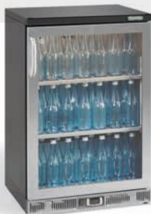
➤ MG2/150RGCS | LG2/150RGCS84 height 90 cm | height 84 cm

The models of the Maxiglass bottle cooler have been fully modernised and improved inside and out. A modern and sleek design combined with improved technologies and components means that the Maxiglass isn't just a fantastic product because of the way in which it presents its contents, but also because it cools beverages in bottles and/or cans in an energy-efficient manner. We present this green series under the name 'Maxiglass Noverta Premium' and guarantee that its lower power consumption will allow you to save up to 125 GBP per year. And you aren't just saving money; you're also investing in an environmental responsible product. The table on page 3 shows how much electricity and money you can save each year thanks to the new Maxiglass Noverta Premium bottle cooler.