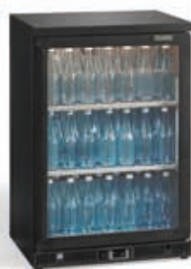
➤ MG2/150RG | LG2/150RG84 height 90 cm | height 84 cm

Fitted with a right hinged glass door frame and kick plate with an anthracite door frame and exterior made of anthracite steel panels