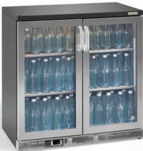
➤ MG2/250GCS | LG2/250GCS84 height 90 cm | height 84 cm

Fitted with 2 hinged glass doors with a stainless steel door frame and kick plate. Exterior made of anthracite steel panels