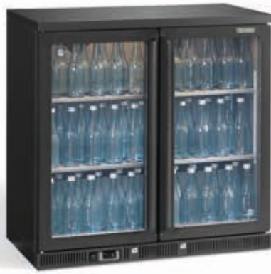
➤ MG2/250G | LG2/250G84 height 90 cm | height 84 cm

The green Maxiglass Noverta is energy-efficient. You will save money and contribute to protecting the environment thanks to its lower energy costs. The design makes the Maxiglass the leading choice for presenting beverages in bottles and cans.