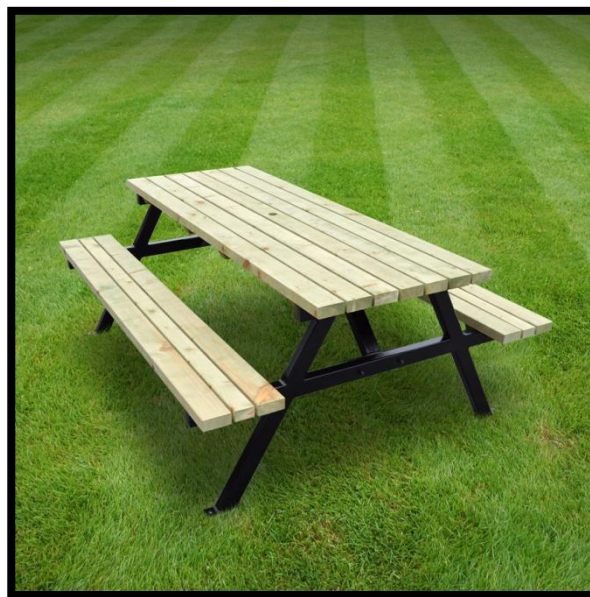
THE OAKHAM STEEL PICNIC BENCH