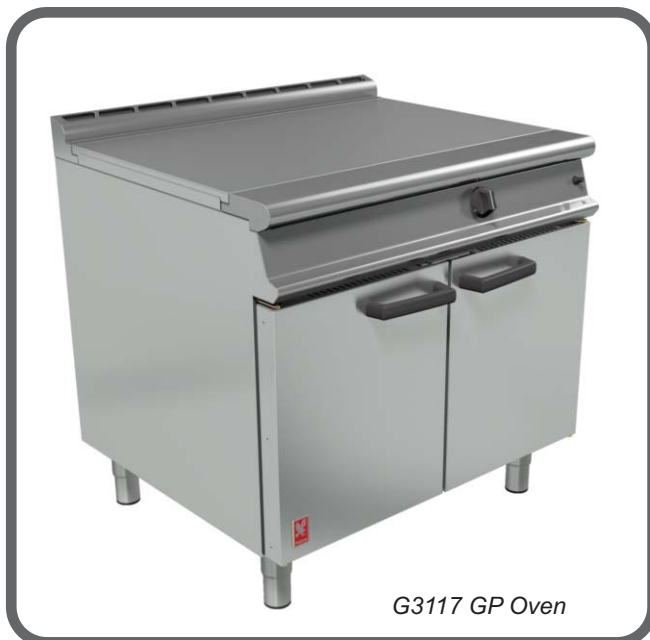
G3117 GP Oven