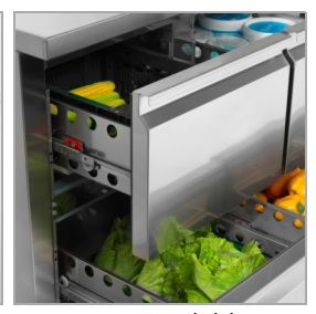
Drawers available as seperate kit