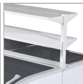
Promotional shelves as accessory