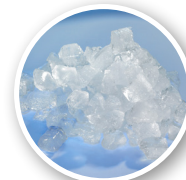
FM-8oKE-HCN Ice: Nugget