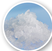
FM-8oKE-HC Ice: Flake