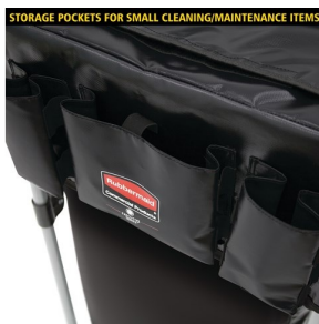
STORAGE POCKETS FOR SMALL CLEANING/MAINTENANCE ITEMS

Rubbermaid Commercial Products X-Cart Folding Trolley on Wheels | Collapsible Frame | Transports Large Loads | Compact & Lightweight | 150L Capacity | 1871643