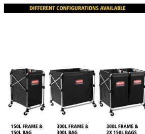
DIFFERENT CONFIGURATIONS AVAILABLE