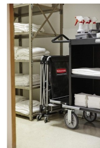
150L FRAME & 150L BAG 300L FRAME & 300L BAG 300L FRAME & 2X 150L BAGS