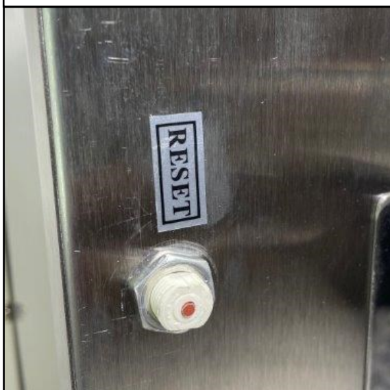
Fig 5 Reset Switch - Fully depressed

If fault persists, please contact your approved maintenance and repair contractor.