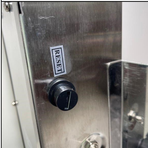
Fig 3 Reset Switch - Capped