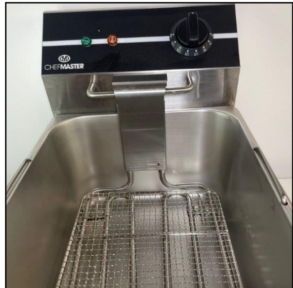
Fig. 2 Element Correctly positioned