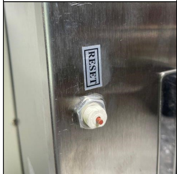
Fig 4 Reset Switch - Uncapped