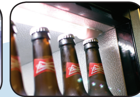
Ultra bright energy efficient LED lighting