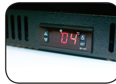
Digital temperature control