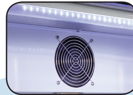
Fan assisted cooling for even temperature