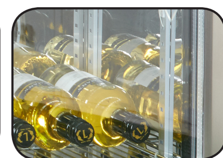
Mirror finish interior (ST, NT10, NT20)