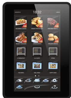
LCD 10" Touch Screen