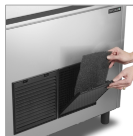
Easy to clean condenser filter